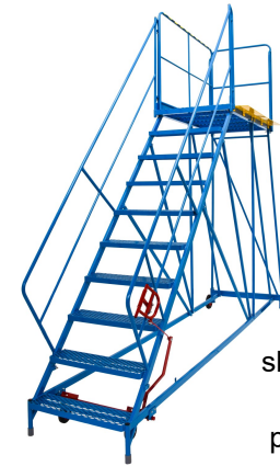
MSP9310C shown with optional MSPX04 platform extension