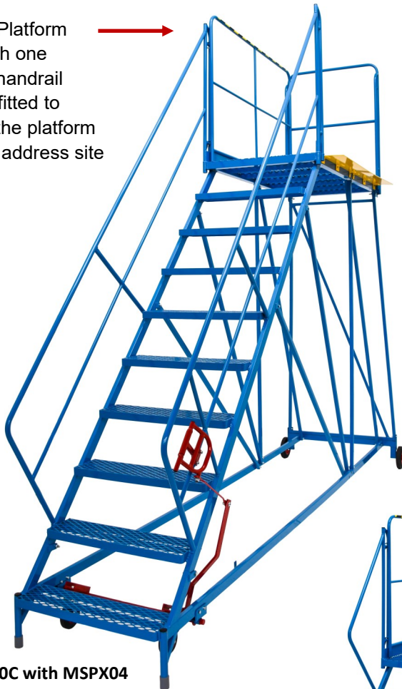
MSP9310C with MSPX04