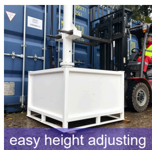
easy height adjusting